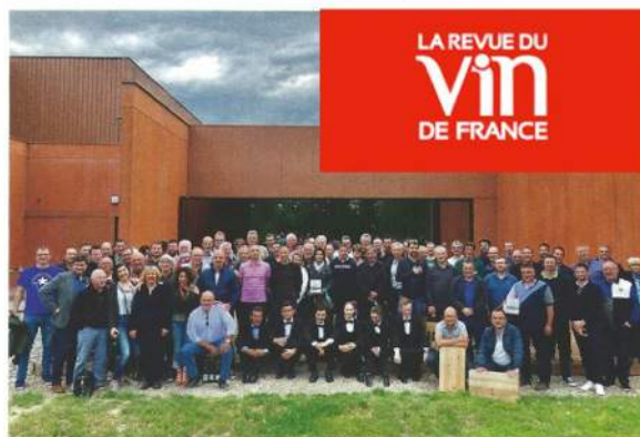
72 équipes se sont affrontées pour les dernières places qualificatives de la finale du 22 juin.

Étape rhodanienne pour une dernière phase qualificative sportive.